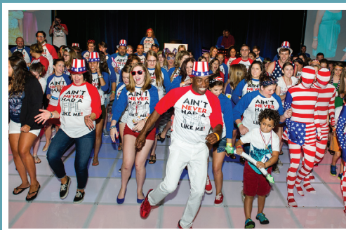
Ain't never had an FFL like me!